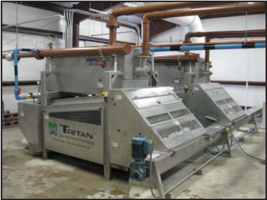
The TRITAN dewatering belt press provides three belt performance with single belt tracking.

The TRITAN is a cost effective solution that combines a sludge pre-thickener with a belt press in one unit. This streamline design eliminates the need for two separate pieces of equipment, reducing the equipment footprint. Simplicity is the TRITAN . This operator friendly belt press offers three belt performance providing excellent dewatering and a dry cake comparable to traditional equipment, but with less moving parts. The seamless belt, together with the drive belt, provides a high performance belt