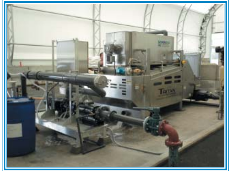
The TRITAN discharges a biosolids cake with a solids concentration of 15 percent to 20 percent.